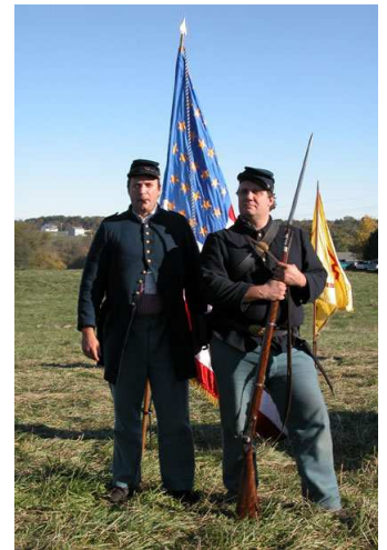
Pictured are two of the many soldiers from the 6th New Hampshire Volunteers, Company C. for this event.

The house was built shortly following the war between the states. The land, an expansive farm is well suited for the encampment.