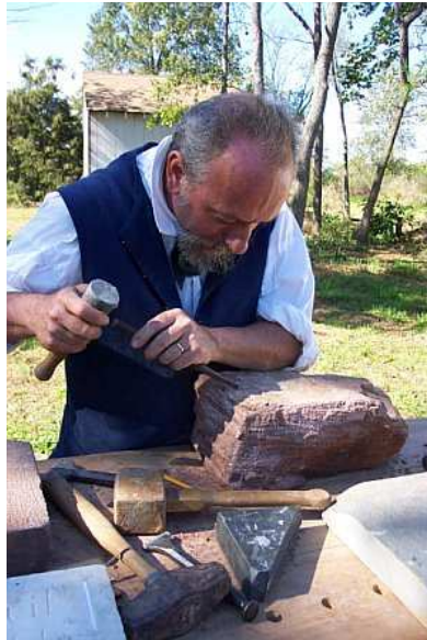
Pictured is a craftsman, and wood-worker demonstrating his talent.

This popular event features crafters, soldiers, civilians, and reenactors who practice the not-so-simple lifestyles of our Colonial American heritage. An excellent opportunity to experience history.