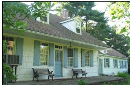
The Van Wickle House, circa 1722