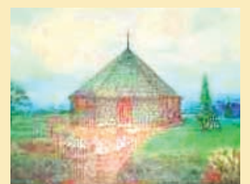
Sketch of early Six Mile Run Reformed Church - 1703